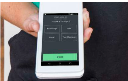
Stores receipts electronically